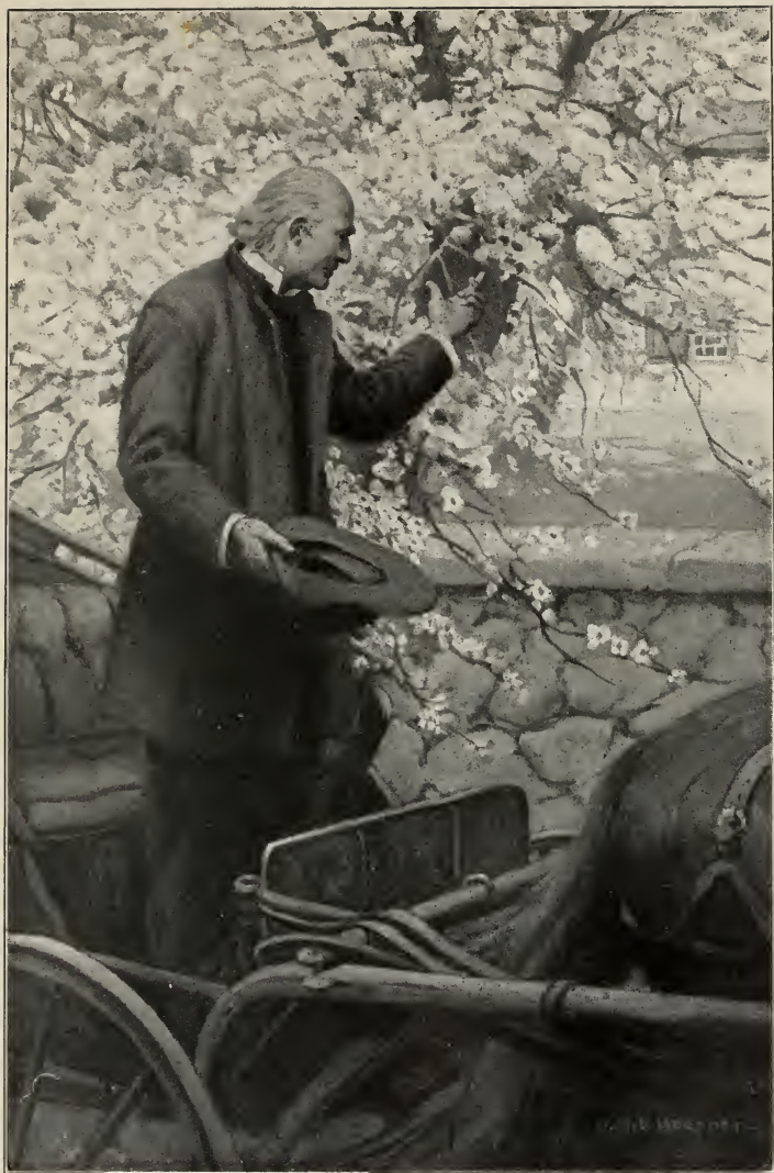
DR. LAVENDAR'S BUGGY PULLED UP AT THEIR GATE